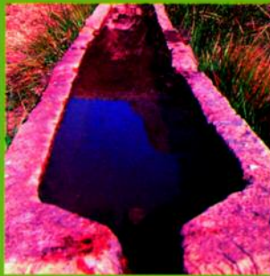
LOS CHICOS DEL BARRIO